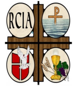
Rite of Christian Initiation for Adults