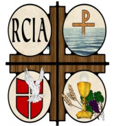
Rite of Christian Initiation for Adults